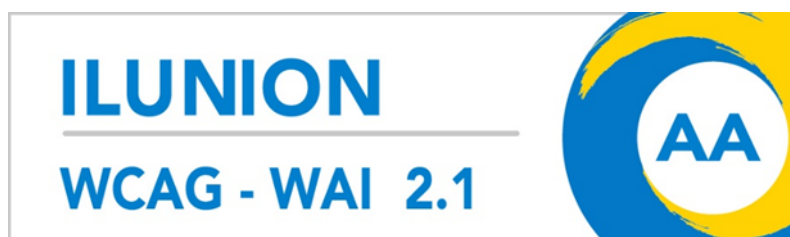
Figure 2. ILUNION WCAG 2.1 AA Seal.

The use of the ILUNION WCAG 2.1 AA certification is granted so that it may be included on your website, always respecting the content contained therein and without making any changes to its structure.